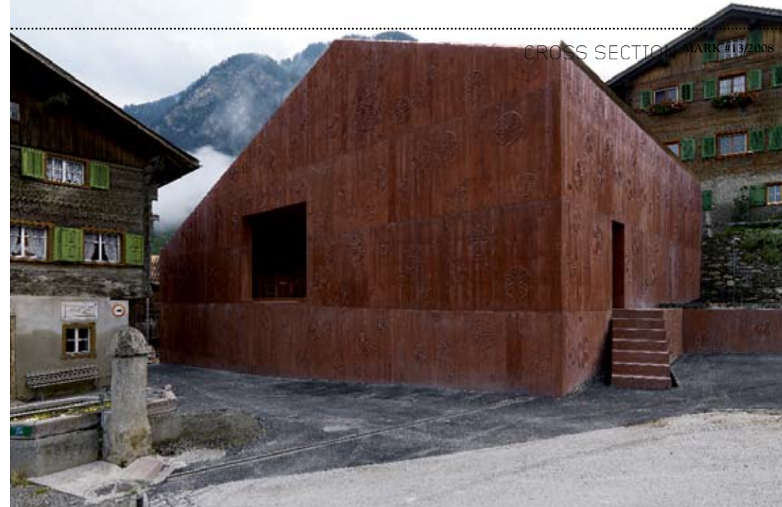
CROSS SECTION MARK #13/2008